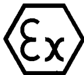
Fig 1 – Specific Marking of Explosion Protection

All equipment and protective systems must be marked visibly, legibly and indelibly with the specific marking of explosion protection (Fig.1), followed by the equipment Group and Category. Full marking detail shall be included in certification and a recapitulation of this marking should appear in the product user instructions.