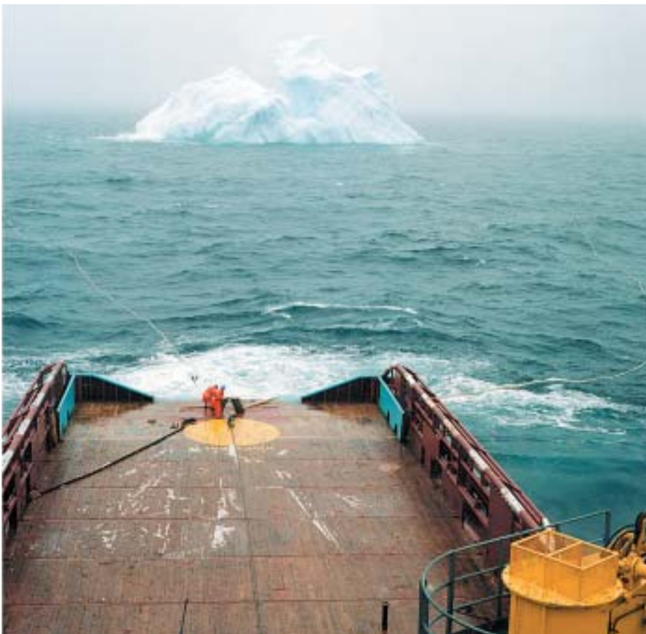
Outside St. John's, NFLD, encroaching icebergs are "lassoed" with a heavy cable and towed by a platform support vessel into a different trajectory.

Thanks to the pioneering work of Hibernia and Terra Nova oil developments off the coast of Newfoundland, Canada is world renowned for engineering for cold